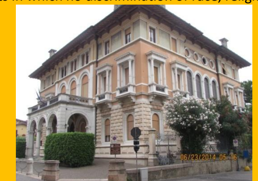
The beautiful Palazzo Feltrinelli.

To celebrate Lawrence's work, I offer a got in Italy with the 1966 publication of "edizione integrale" in the popular