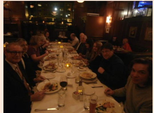
Scenes from McCormick & Schmick's at the 2013 DHLSNA Dinner