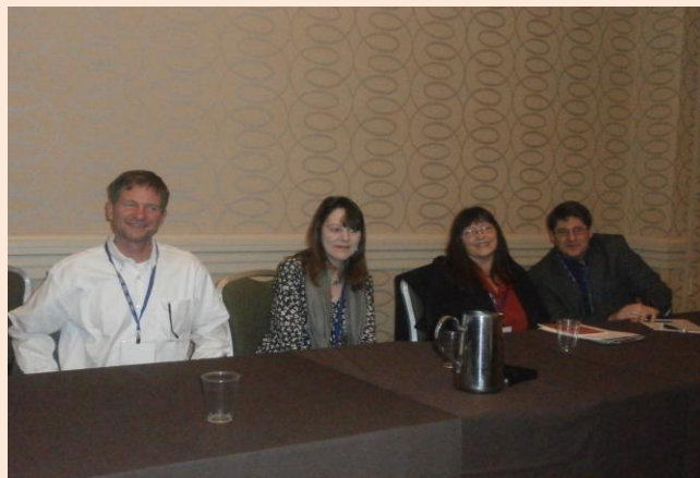
Boston MLA Lawrence Panel